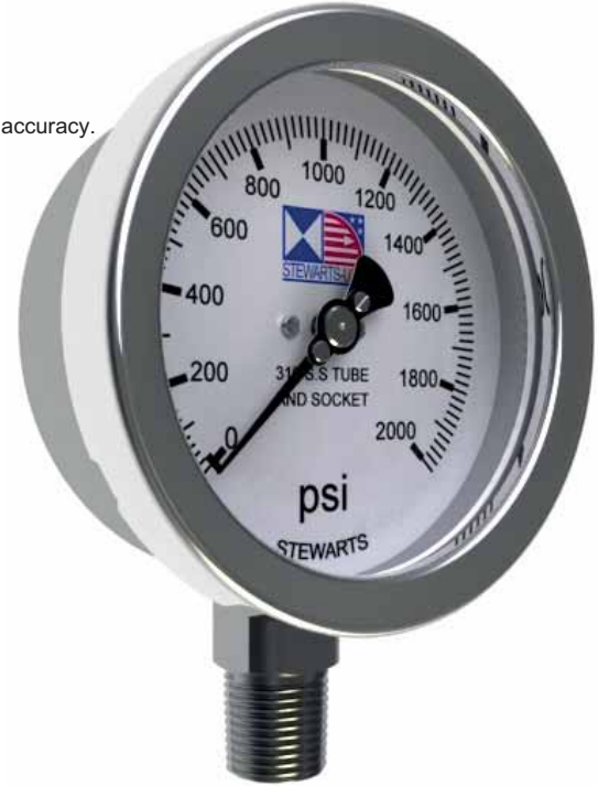
Model shown is 41S-2K To order other models by part no, See below.

Text in Red denotes HIGH PRESSURE CONNECTIONS REQUIRED