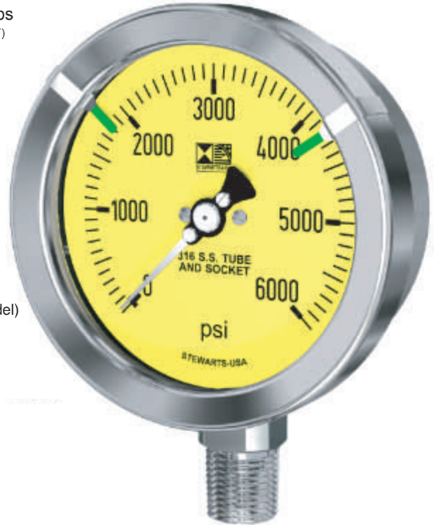
Model Shown: 41S-6K-G To order other models by part number, see below.